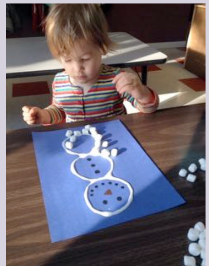
Noelle making a Snowman!